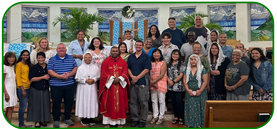
In preparation for the new catechetical year, those entrusted to teach our children about their faith gathered for a special Mass.