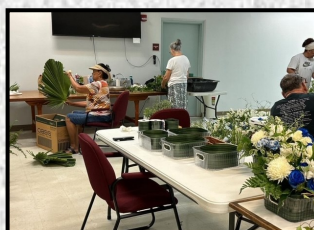
Prepping the Flowers