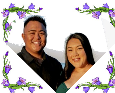
Congratulations Newly Weds!

We will take up a coin collection for the India Mission which provides support for the educational needs of poor children, and also the needs of the elderly. Flyers explaining the vision of this charitable trust are on the welcome table. Please take one, read it over and if so moved, make a donation. No amount is too small. Thank you for your support.