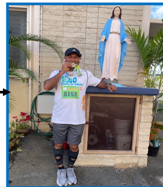
Home after a successful run!