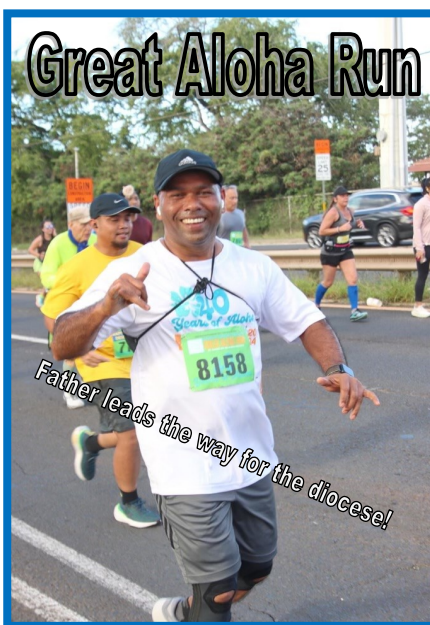
Father leads the way for the diocese!

Mahalo to our Good Samaritan and WAC ministry members for preparing the soup that was enjoyed by many who attended Friday Stations of the Cross, the past two weeks.