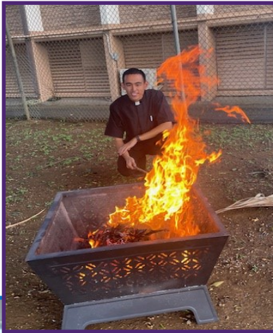
Burning palms for Ash Wednesday.