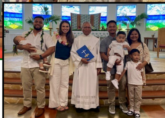
Special blessings for the families and newly baptized children of the parish.