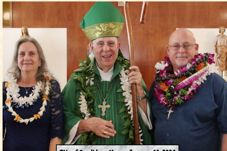
Rite of Candidacy Mass ~ January 14, 2024