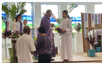
Lighting the First Advent Candle