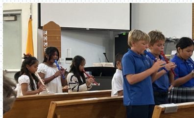
First Saturday Mass of the Month with our ES families.